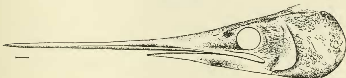
FIG. 1.— Istiophorus nigricans (Lacépède).

Makaira nigricans Lacépède, Hist. Nat. Poiss., IV, 1803, p. 688. Sur un rivage de la mer voisin de la Rochelle. (M. Traversay.)